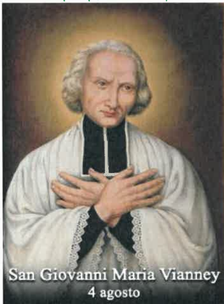
San Giovanni Maria Vianney 4 agosto

Ti amo, o mio Dio, e il mio solo desiderio è di amarti fino all'ultimo respiro della mia vita. Ti amo, o Dio infinitamente amabile, e preferisco morire amandoti piuttosto che vivere un solo istante senza amarti. Ti amo, Signore, e l'unica grazia che ti chiedo è di amarti eternamente. Mio Dio, se la mia lingua non può dirti ad ogni istante che ti amo, voglio che il mio cuore te lo ripeta tante volte quante volte respiro. Ti amo, o mio Divino Salvatore, perché sei stato crocifisso per me, e mi tieni quaggiù crocifisso con Te. Mio Dio, fammi la grazia di morire amandoti. Amen. (Preghiera di S. Giovanni Vianney).